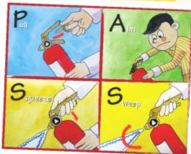
How to use a fire extinguisher

If your clothes catch fire: Stop, Drop and Roll